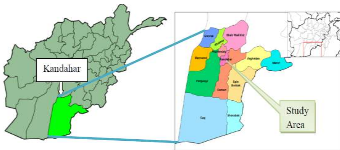
Figure 2.1 Map of Kandahar City

Afghanistan has the condition of imbalance timely and special diffusion precipitation is caused of the scarcity of water resource. as well as, approximately 80 percent of the precipitation falls where the elevation is high than 2000 m and the remaining 20 percent falls on the area that is lower than 2000 m in winter, approximately 47 percent from the total precipitation is discharged outside the country, (Favre. 2004). Water consumption in Afghanistan for the sectors such as agriculture, domestic, and industrial are 98%, 1.5%, and 0.5% respectively, (Alim. 2006).